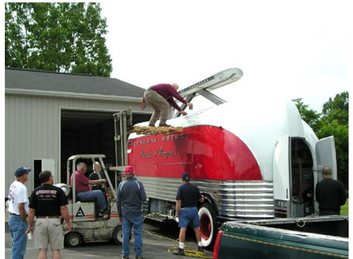
June 2010 Work Session