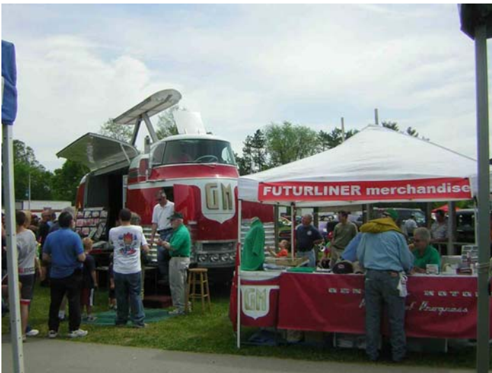
April 2010 - Rhinebeck, NY Show