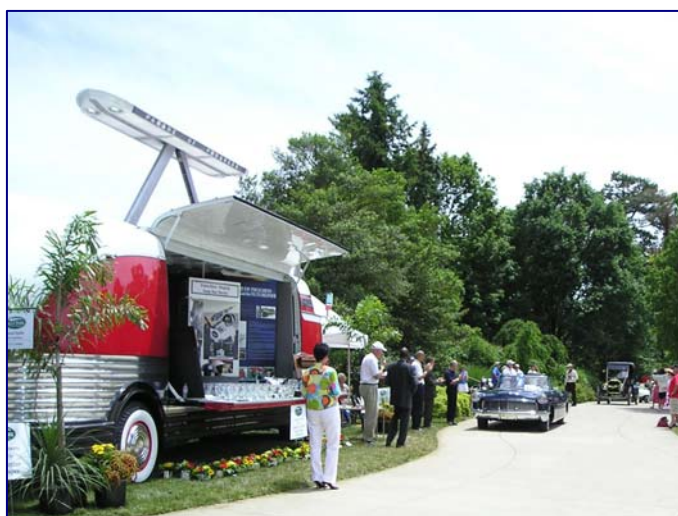
Cincinnati – June, 2007